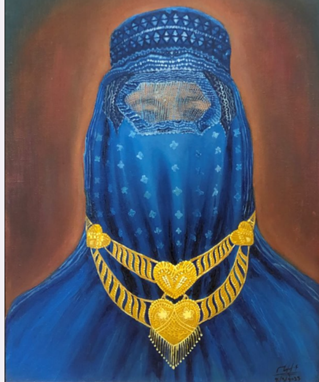
A work painted by one of our refugee artists-at-risk fellows

After many months of difficult coordination, Silkroad has safely resettled three Afghani refugees to the United States, providing shelter, support, and freedom to pursue their art.